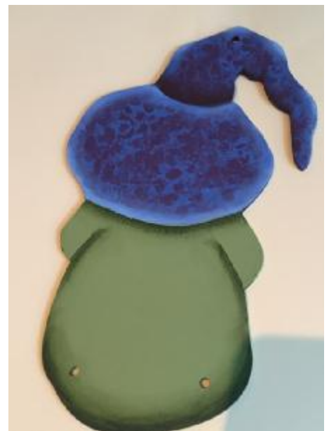
This back view has highlights and shading already done.