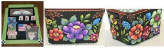
Connie and Karen

this main fundraiser for the preschool would be very much appreciated. Painted items and gift baskets have been a big hit in the past. This is another way we can show our appreciation for the church allowing us to use the meeting room. The items should be brought to the January meeting.