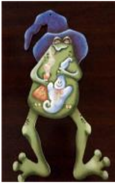
Halloween frog that Liz Little is teaching at the October meeting.